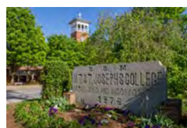
Mount St. Joseph High School Baltimore, MD