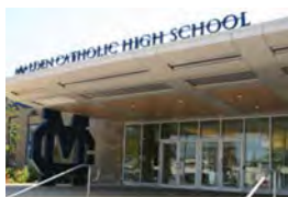
Malden Catholic High School Malden, MA