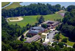
St. Mary's Ryken High School Leonardtown, MD