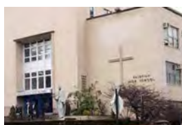
Xaverian High School Brooklyn, NY