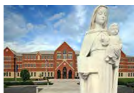
Our Lady of Good Counsel High School Olney, MD