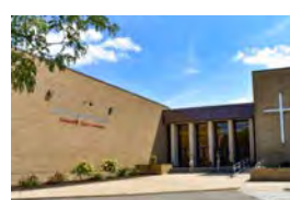
St. Bernard School Uncasville, CT