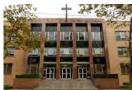
Nazareth Regional High School Brooklyn, NY