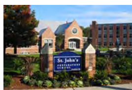
St. John's Preparatory School Danvers, MA