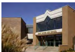
St. Xavier High School Louisville, KY