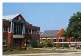
St. John's High School Shrewsbury, MA