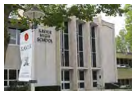
Xavier High School Middletown, CT