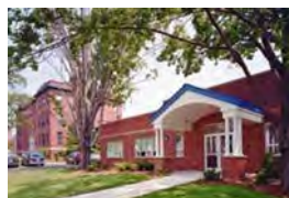
Lowell Catholic School Lowell, MA