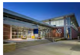
Xaverian Brothers High School Westwood, MA