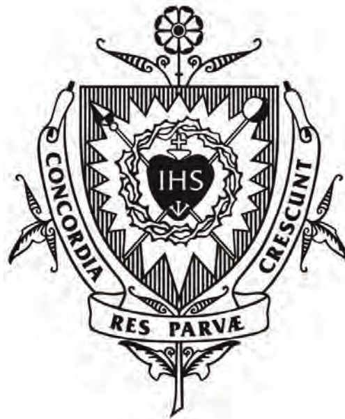
Seal of the Xaverian Brothers

These principles and practices are intended to assist boards and school leaders with a deeper understanding and appreciation for the entire mission of a Xaverian Brothers Sponsored School.