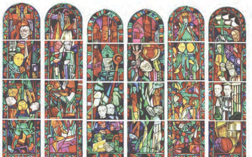
Significant historical events in the founding of the Xaverian Brothers are showcased within these six, stained glass windows - located within the chapel at the St. Francis Xavier Institute in Bruges, Belgium.